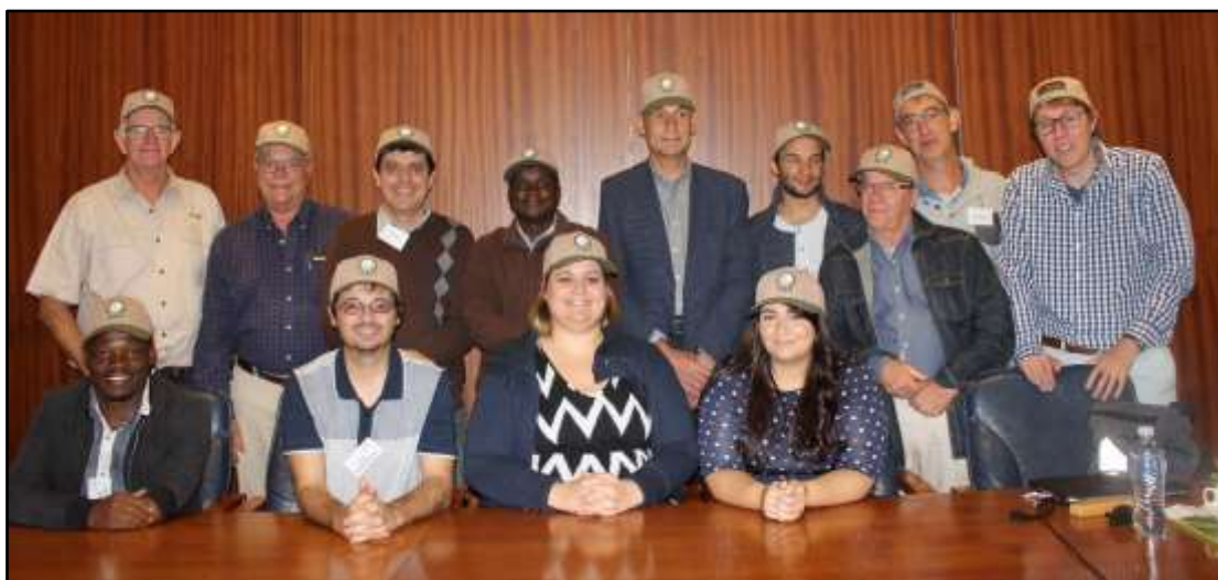
Figure 1. Delegates of the ICSM Trait modelling workshop held at Mount Edgecombe in June 2017.